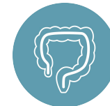
Changes in stool (oily or watery)