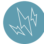
Abdominal and/or mid-to-upper back pain