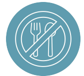
Nausea/loss of appetite